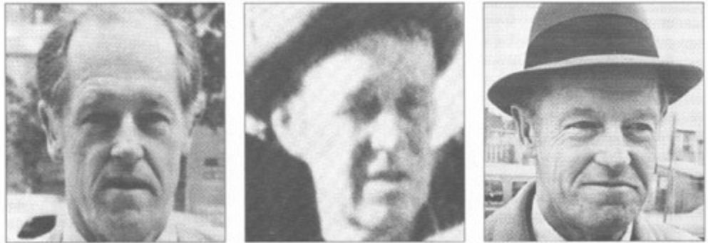
E. Howard Hunt, L & R; Tramp, Center

After his release, Hunt moved to Miami, where he remarried, had two more children and spent three decades living a quiet, unexceptional life, steadfastly refusing to talk about Watergate, much less the Kennedy assassination. His connection to the JFK